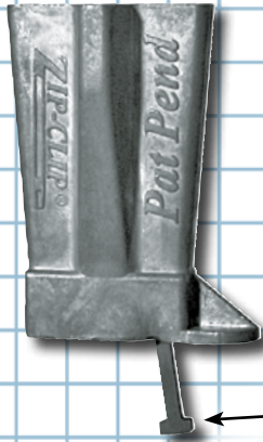
"T" shaped release

The Zip-Clip cable lock combined with cable is a more efficient method. The Zip-Clip has a spring loaded pawl which allows entry and passage of cable through the cable lock. Once engaged by the pawl, the cable is gripped with increasing pressure as the suspended load is increased. To ease adjustment, each Zip-Clip cable lock has an integrated release to disengage the gripping pawl.