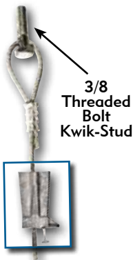
3/8 Threaded Bolt Kwik-Stud

PO Box 1311 ■ Brentwood, NY 11717 Tel: 631-930-7532 Fax: 631-249-8976 ■ www.rizellc.com ■